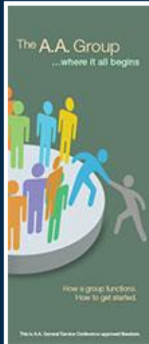
© The above graphics used with permission of A.A. World Services, Inc.

Alcoholics Anonymous Visit us at www.aa.org